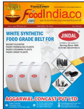
FOODINDIA.CO MONTHLY MAGAZINE