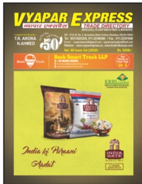
VYAPAR EXPRESS FOOD INDIA DIRECTORY

FOOD INDIA DIRECTORY | FOOD INDIA GRAIN BROKERS & MILLERS DIRECTORY FOOD INDIA WHOLESALE MERCHANTS DIRECTORY | FOOD INDIA EXPORTERS & IMPORTERS DIRECTORY FOOD INDIA GRAIN PROCESSING MACHINERY DIRECTORY | FOOD INDIA PACKAGING DIRECTORY