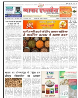
VYAPAR EXPRESS WEEKLY NEWSPAPER

BUILD YOUR BRAND DISTRIBUTOR DEALER NETWORK