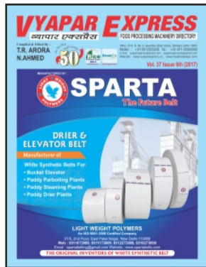
GRAIN PROCESSING MACHINERY DIRECTORY