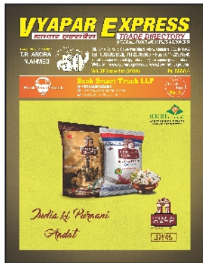
VYAPAR EXPRESS FOOD INDIA DIRECTORY

FOOD INDIA DIRECTORY | FOOD INDIA GRAIN BROKERS & MILLERS DIRECTORY FOOD INDIA WHOLESALE MERCHANTS DIRECTORY | FOOD INDIA EXPORTERS & IMPORTERS DIRECTORY FOOD INDIA GRAIN PROCESSING MACHINERY DIRECTORY | FOOD INDIA PACKAGING DIRECTORY