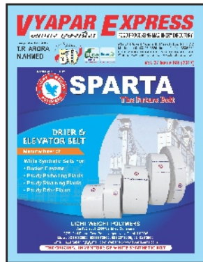
GRAIN PROCESSING MACHINERY DIRECTORY