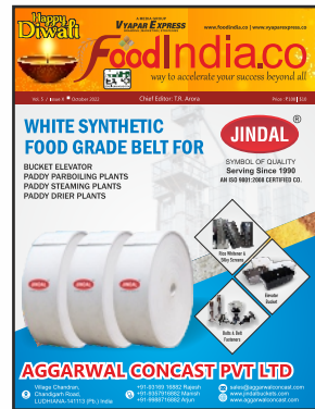
FOODINDIA.CO MONTHLY MAGAZINE