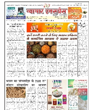
VYAPAR EXPRESS WEEKLY NEWSPAPER

BUILD YOUR BRAND DISTRIBUTOR DEALER NETWORK